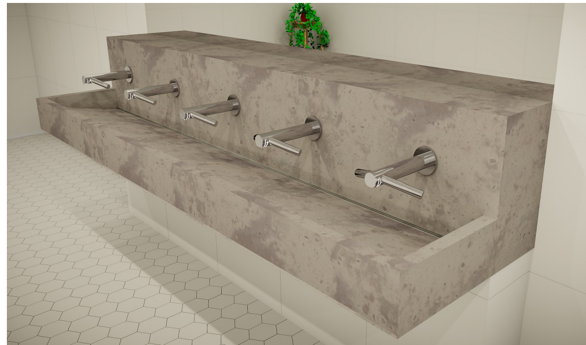
COLOUR: Staron Supreme Dawn