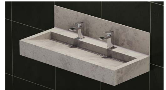
COLOUR: Staron Supreme Dawn