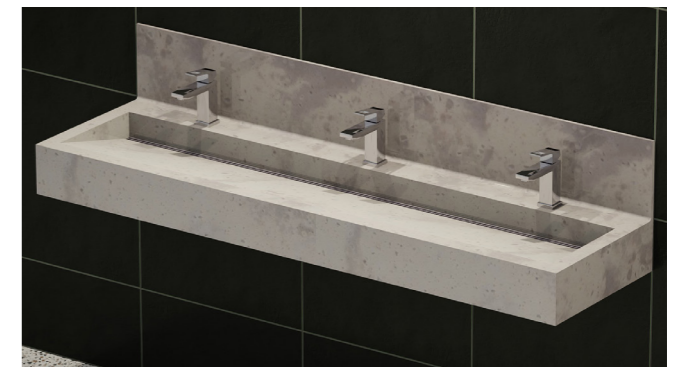
COLOUR: Staron Supreme Dawn