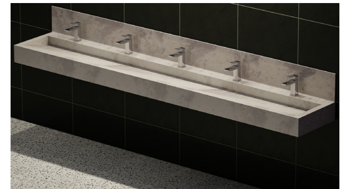
COLOUR: Staron Supreme Dawn