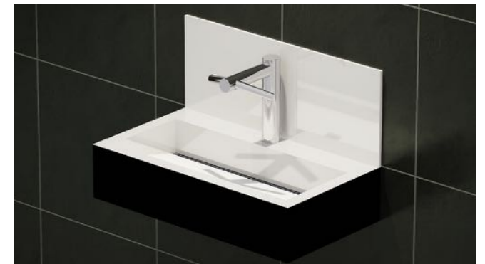
COLOUR: Staron Bright White and Onyx