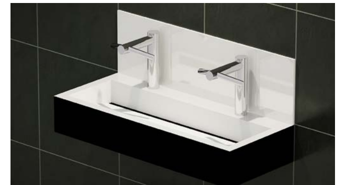
COLOUR: Staron Bright White and Onyx