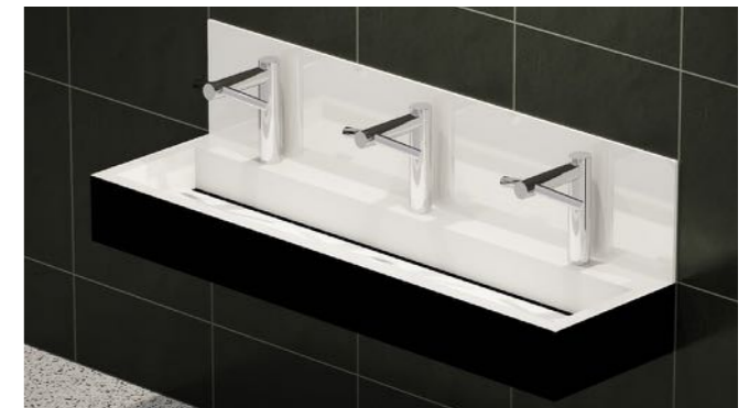
COLOUR: Staron Bright White and Onyx