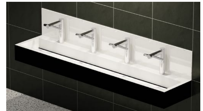
COLOUR: Staron Bright White and Onyx