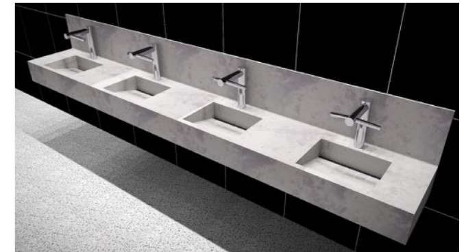
COLOUR: Staron Supreme Dawn