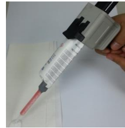
Discharge initial mixture