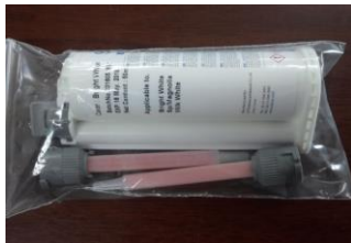
< 50ml cartridge >

The cartridge package contains 1 cartridge and 2 mixer tips. A cartridge dispenser is required for using the cartridge adhesive. Components A and B are separated in the cartridge chambers. The hardening begins when the A and B components are combined through the mixer tip.