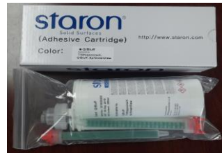
< 250ml cartridge >