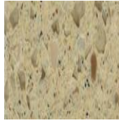
Tempest Caraway Minimum 1%