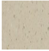
Aspen Cliff Minimum 1%