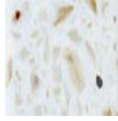
Tempest Horizon Minimum 1%