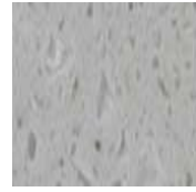
Sanded Heron Minimum 1%