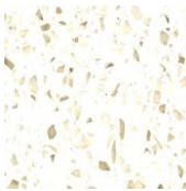
Tempest Pinacle Minimum 4%

This Technical Bulletin is intended to provide guidelines for optimal fabrication, installation, and performance of Lotte Chemical Corp. products mentioned. Though the information contained herein is deemed reliable, none of the contents--including but not limited to the instructions, techniques, graphics, and recommendations--is to be understood as implying legal liability of fitness for a specific purpose, any other type of warranty, or being complete or absolute in its range and nature of information.