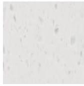
Aspen Alder Minimum 1%